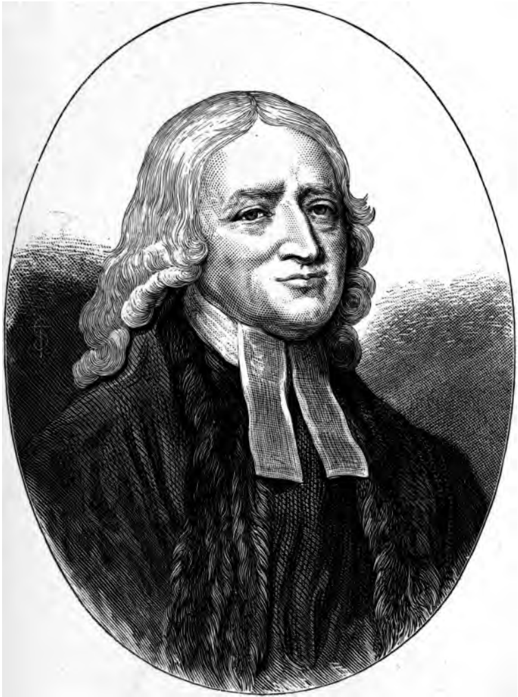
REV. JOHN WESLEY.